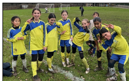
The girls after their last game of the season